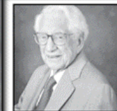
Carl Lindner Jr.