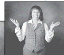
Sharon M. Draper